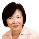
Law Fan Chiu Fun Fanny GBS, JP, aged 63, A, S (Appointed on 17 August 2011 and reappointed on 1 August 2012)