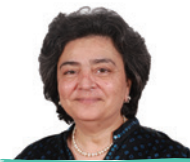
Zia Mody LLM, aged 59, H (Appointed on 2 July 2015)