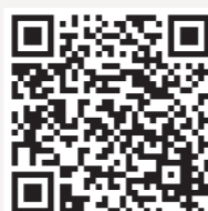
A Snapshot of 2017 Annual Report