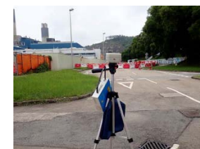
On-site noise monitoring