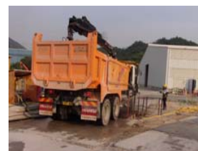
Use of treated waste water preventing off-site discharge of dirt & dust