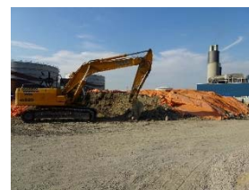
Storage on-site and re-use of excavated materials reducing off-site disposal of construction waste