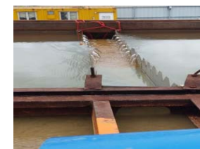
Treatment of site waste water