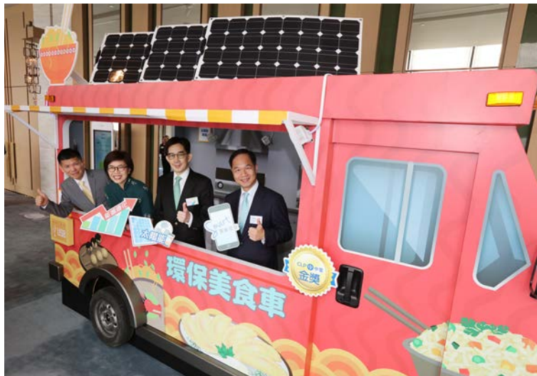
Booths at the award ceremony showcase energy saving solutions and highlight innovative efforts by winning entrants to promote greener energy use. One of the booths demonstrates a green food truck which installed solar panels on its roof to power its cooling fans.