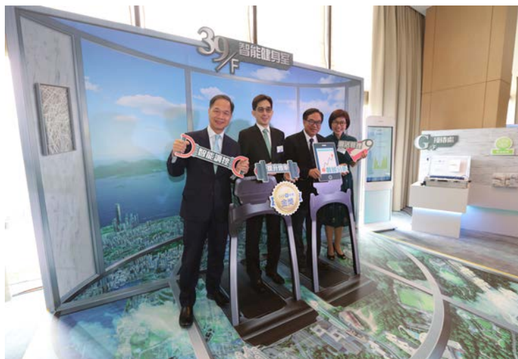
Residential Clubhouse with Smart Energy Management Solution