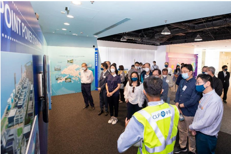
The legislators visit the gallery in the Black Point Power Station to learn more about the operation and environmental benefits of gas-fired generation.