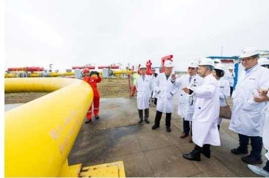
CLP management visits CNOOC's central control centre and natural gas pipeline facilities at the Zhuhai Gaolan Terminal, exchanging views on business cooperation.